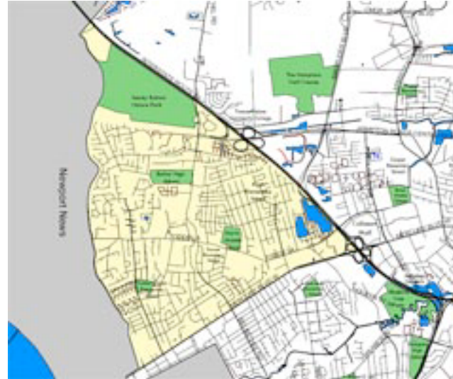
Map of Northampton Civic League Area

This area encompasses about 6,000 residences and 18,000 people. Are they all members of the league? Not yet, but we're working on it.